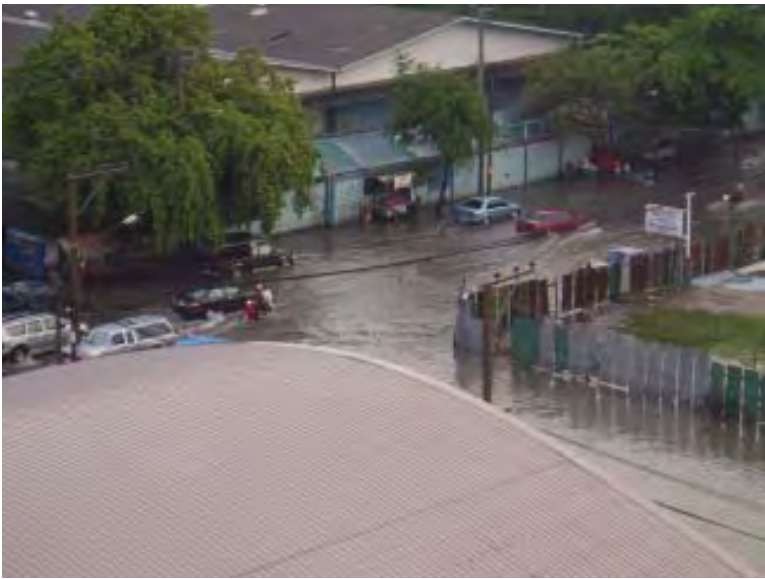
Flooding in Bangkok

in planning adaptation, and that this will require a decentralization of climate change as the sole stimulus for planned and autonomous adaptation. Along this line, a researcher from Indonesia felt that the climate change agenda is better off residing in the development planning ministry rather than in the environment ministry in order to ensure a more holistic approach of enabling people's adaptive capacity and resilience towards climate change. No-regrets approaches to adaptation could also then be supported.